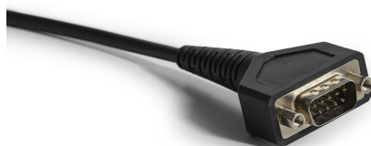
Figure 3: The 9-pin D-SUB CAN connector.

The CAN connector for the Kvaser U100 is the 9-pin D-SUB connector (see Figure 3) which has the pinout described in Table 2 on Page 9.