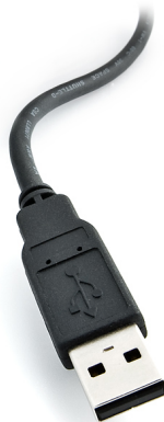
Figure 2: A standard USB type “A” connector.

The USB connector for the Kvaser U100 is a standard USB type “A” connector (see Figure 2).