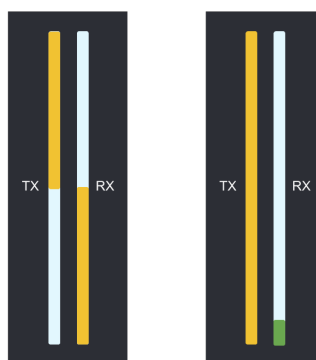
Figure 7: The yellow-lit area of the LED bars is proportional to the bus load. Both images indicate a bus load of 100%.

at 50% bus load. Figure 7 on Page 12 shows two different bus load conditions. The image on the left shows the unit transmitting and receiving data corresponding to 50% bus load in each direction for a total of 100% bus load. The image on the right shows the unit transmitting data corresponding to 100% bus load.