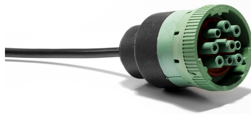
Figure 3: J1939-13 Type II CAN connector.

The CAN connector for the Kvaser U100-X1 is the 9-pin J1939-13 Type II connector (see Figure 3) which has the pinning described in Table 2 on Page 9.