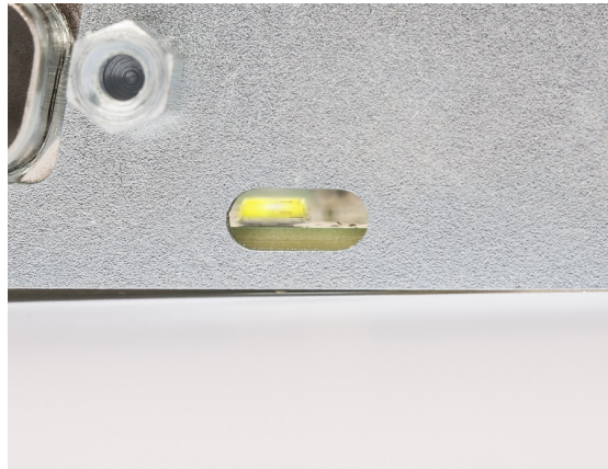
Figure 3: LED on the Kvaser PCIEcan 1xCAN v3.