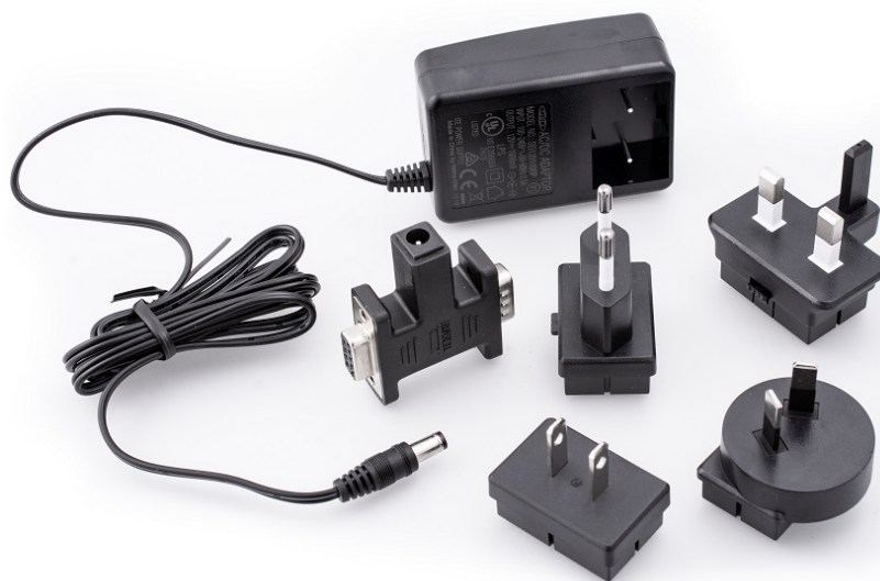
Figure 1: Kvaser DB9-Power Inlet

Kvaser DB9-Power Inlet is a power injector for CAN busses from a DC power jack into one female D-SUB9 connector. The Kvaser DB9-Power Inlet also has one unpowered male D-SUB9 connector for connecting to the CAN network. The Kvaser DB9-Power Inlet provides a simple and safe way to supply Kvaser bus powered interfaces with power, such as Kvaser's Blackbird and Memorator series.